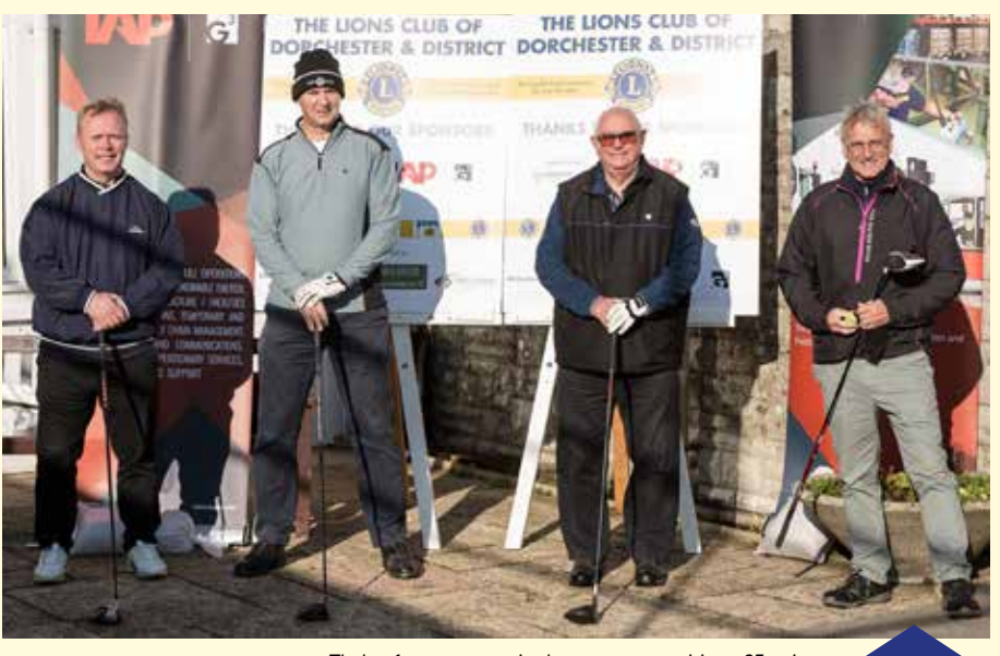
Thales 1, runners-up in the team competition - 85 points

This year's competition will be held on : Friday 24th September 2021 at Came Down Golf Club.