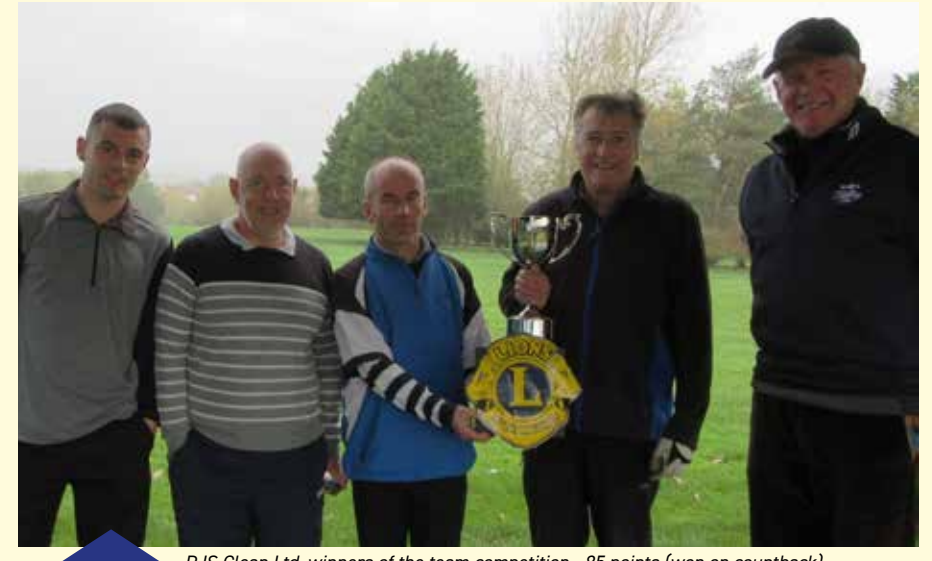
RJS Clean Ltd, winners of the team competition - 85 points (won on countback)